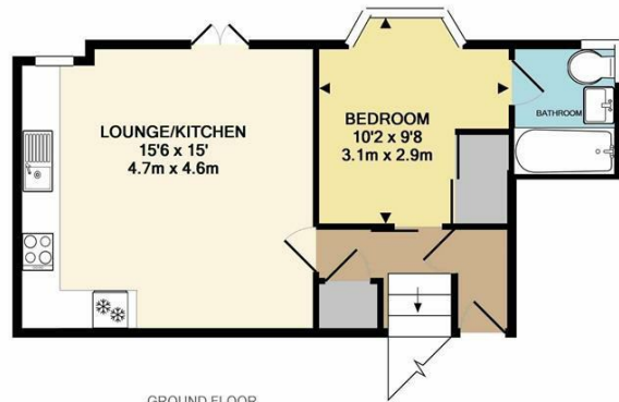
GROUND FLOOR APPROX. FLOOR AREA 427 SQ.FT. (39.7 SQ.M.)